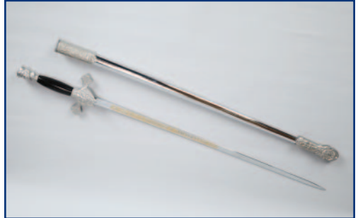
Black Handled Sword with Scabbard