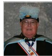
Vice Supreme Master Singer