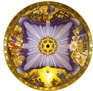
KNIGHTS OF COLUMBUS INCARNATION DOME

I want to make another pitch to ALL ASSEMBLIES who have not yet sent in their Dome Fund Donations. This should be done by 100% of the Assemblies in the United States, and must be to Supreme by June 2008. If your Assembly has not yet made their donation, please get it in NOW. Some Districts were in very poor shape for donations as of the last reports. One District in the Province had met their 100% goal for donations.