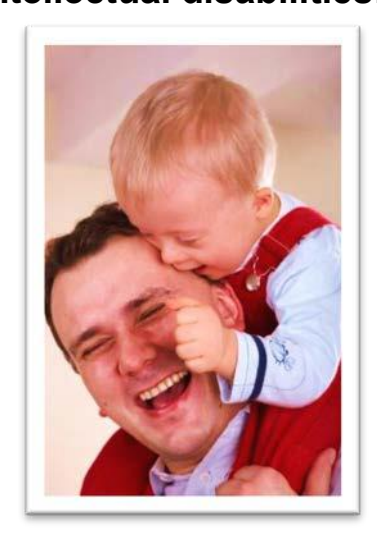
the Least Among My Brethren